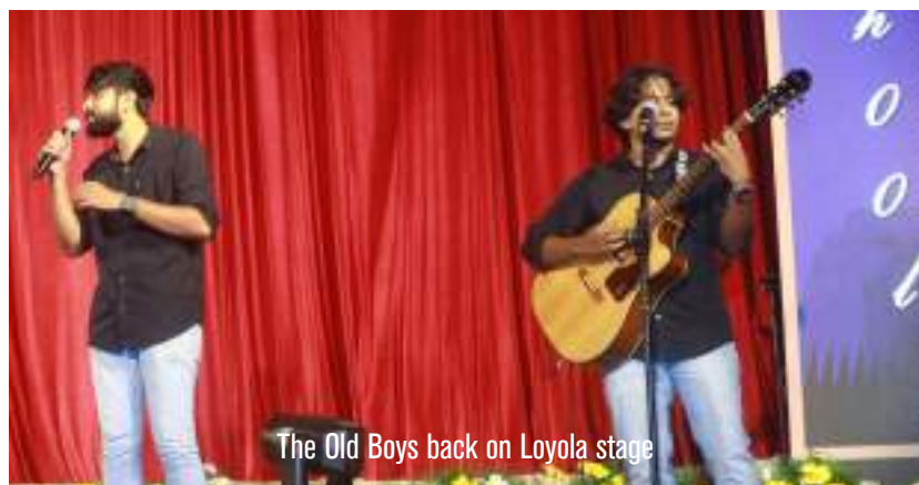
The Old Boys back on Loyola stage