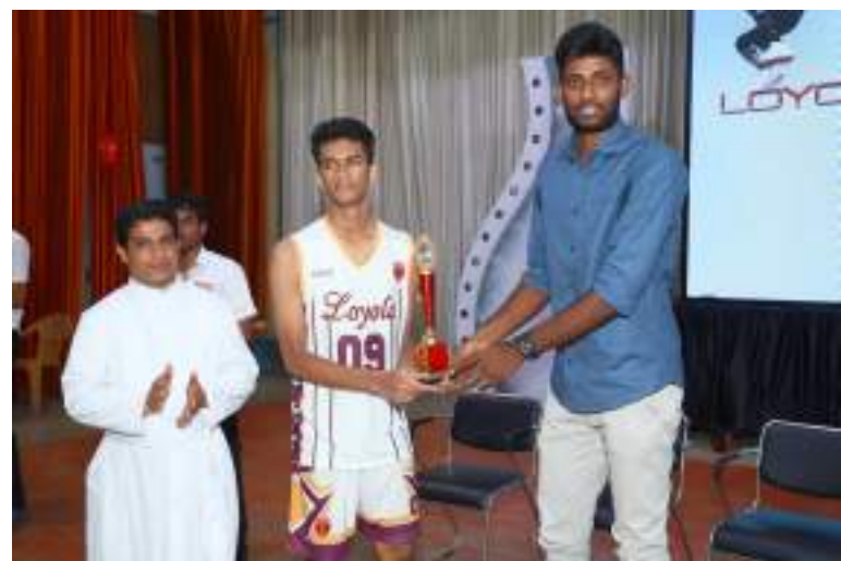
The finalists with their spoils