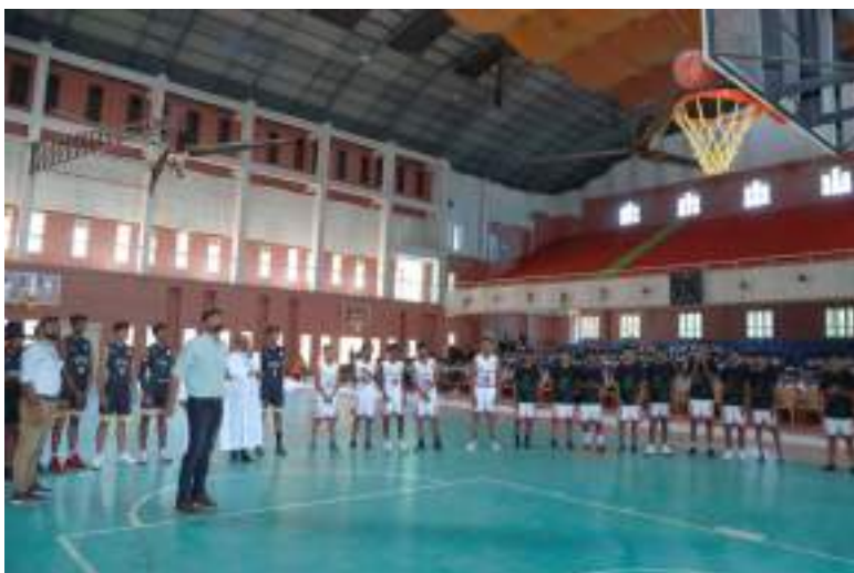
Inaugural shot by the chief guest of the opening day, Shri Umesh Krishna