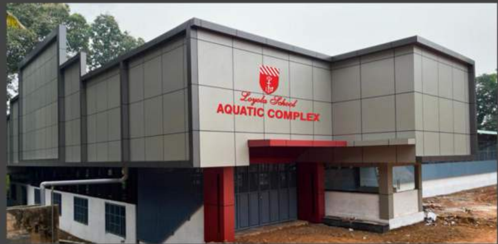
INAUGURATION OF THE AQUATIC COMPLEX AND PARKING SLOT-CUM-PLAY AREA