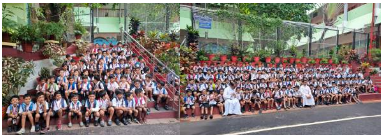
UKG kids all set to board the bus for a day of fun and adventure